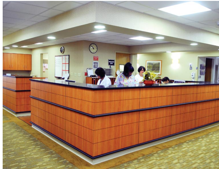
The Joint Replacement Center at Nyack Hospital is comfortable and hotel-like, and all patient rooms are private. One benefit, among many, of having joint replacement surgery at Nyack: Your own doctor can care for you here if any issues arise.